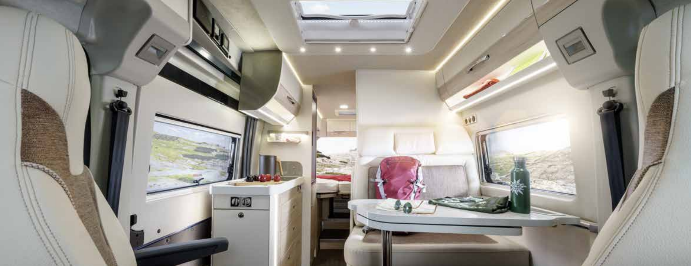
Relaxing sleeping comfort on the single beds measuring up to 1.95 m in length and a high degree of storage space variability are the striking individual strengths of the V 635EB. The storage boxes in the rear, which can be removed in no time at all with a toggle lock, allow extremely flexible use of the rear storage space.