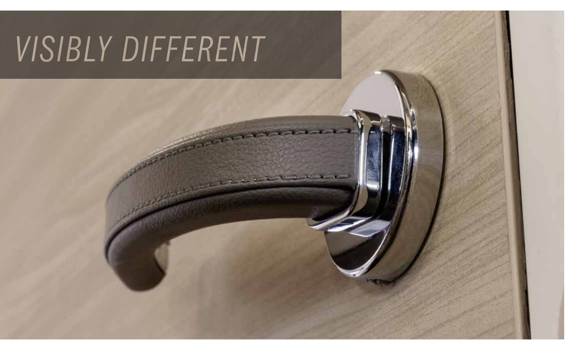
In the new Premium van from Eura Mobil, the exclusive ambience transforms every moment into a special moment. Feel the fine materials and experience the individual details that make the Eura Mobil van your very own mobile home. Take your time and let the interior work its magic on you ...