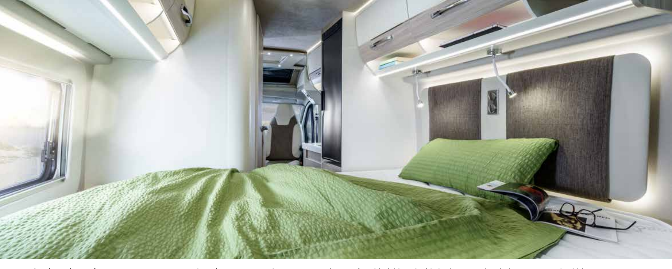
The classic layout for compact vans up to 6 m in length impresses on the V 595 HB with a comfortable folding double bed equipped with disc springs and cold foam mattress, including swivelling LED reading spotlights with USB ports on the upholstered headboard.