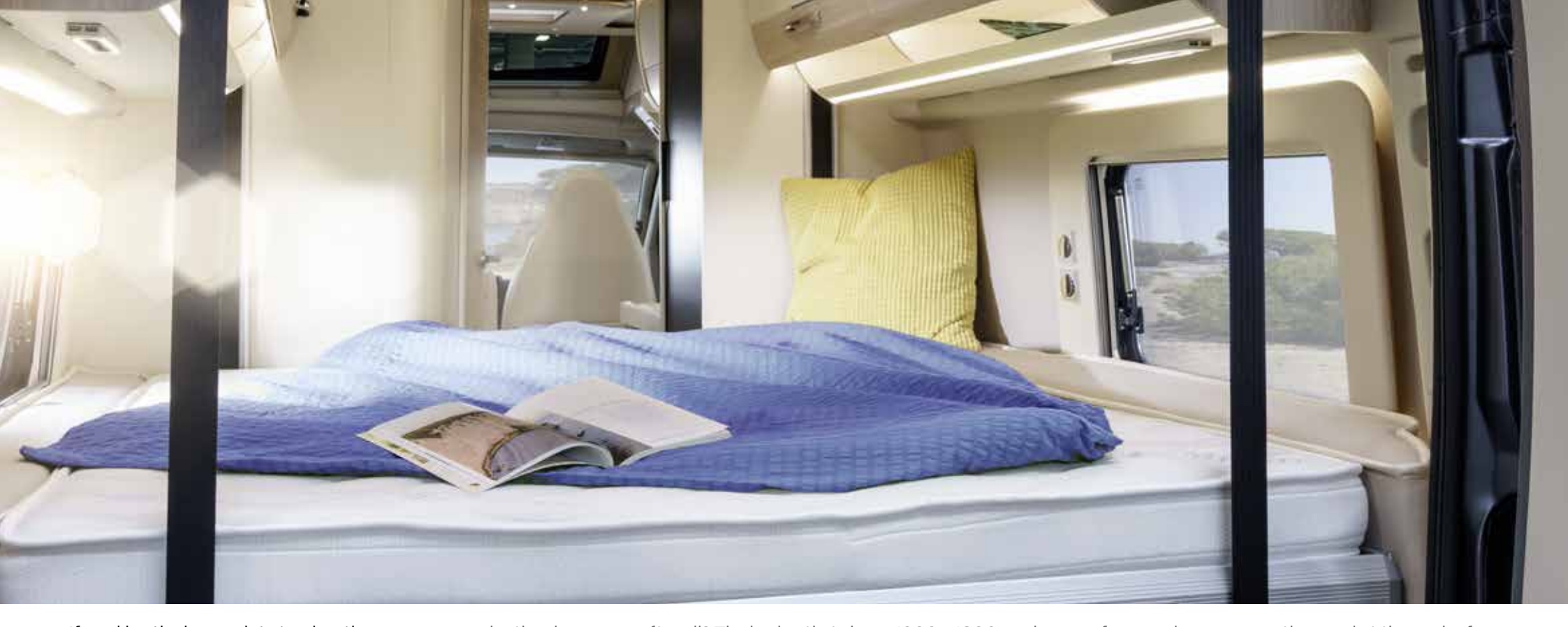
If you like, the heavy-duty truck in the range - or maybe the sleeper car after all? The bed with its huge 1900 x 1800mm lying surface can be conveniently raised at the push of a button, revealing a loading space of 1800x1200x1300mm (LxWxH) – one that even fits many motorbikes.